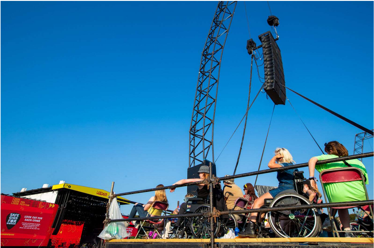
(Image: Customers watching an outdoor from the side of the Accessible Viewing Platform)

If you need to charge anything else – due to your access requirements, please speak to a member of the access team.